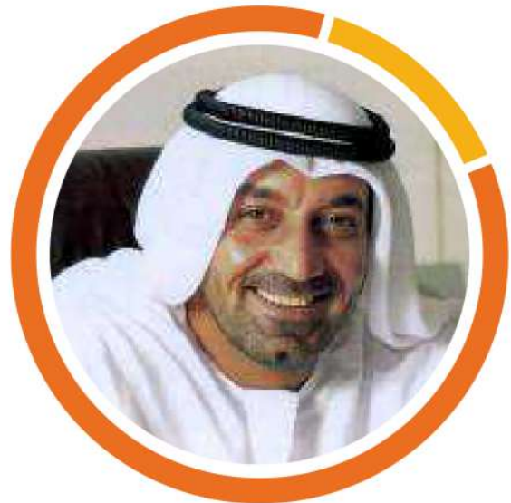
H.H. Sheikh Ahmed bin Saeed Al Maktoum Chairman and Chief Executive, Emirates Airline and Group Chairman, Dubai Airports Event Patron

The exhibition will be complimented with an international conference, demonstration and sports