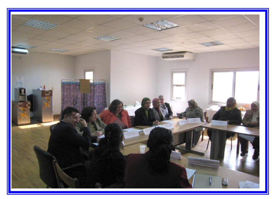
Training Course in Maternal & Neonatal Health Nursing in Faculty of Nursing, Cairo University

- A training program was organized in the field of "Maternal & Neonatal Health Nursing", in the Center for Training and Research Consultation, Faculty of Nursing, Cairo University, for 20 trainees from: Nigeria, Lesotho, Zambia, Uganda, Malawi, Mozambique, Ethiopia, Cameroun and Ghana, for 3 weeks starting 19/1/2011.