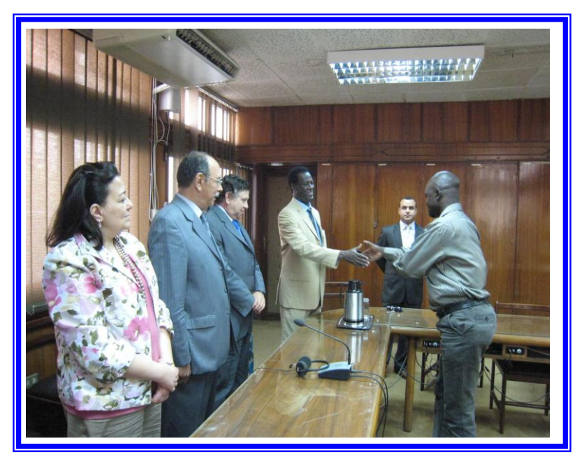
Training Program in Fish Culture Development, Joint Cooperation with the Egyptian Fund, in the Egyptian International Centre for Agriculture (EICA), Cairo

- "Animal Health" in EICA, for 12 trainees from Uganda, Sudan, Rwanda, Chad, Eritrea and Ethiopia, from 18/12/2011 to 5/1/2012.