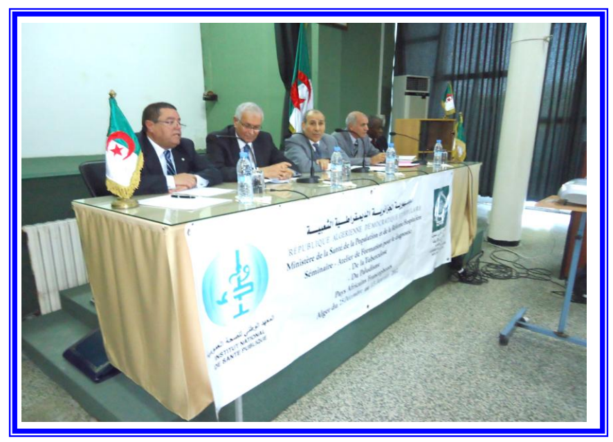
Closing ceremony of Training programs for Fighting Tuberculosis and Malaria in the National Institute for Public Health, Algeria

- "Fighting Malaria", in the National Institute for Public Health, Algeria, for 20 trainees from: Senegal, Burundi, Chad, Niger, Congo, Togo, Côte d'Ivoir, Benin, Mali and Guinea, from 25/12/2011 to 12/1/2012.