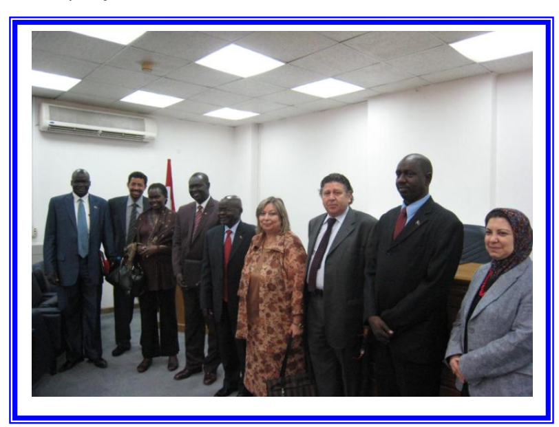
Training Program in Diplomacy, Joint Cooperation with the Egyptian Fund, in the Institute for Diplomatic Studies, Cairo

- "Diplomacy", in the Institute for Diplomatic Studies, for 19 diplomats from : Rwanda, Ethiopia, Tanzania, Zambia, Sierraleone, Uganda, Sudan, Eritrea, and Kenya, from 8/5 to 19/5/2011.