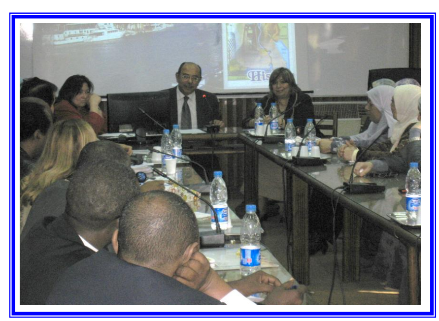
Training program in Animal Health, Joint Cooperation with the Egyptian Fund, in EICA

- "Animal Health" in EICA, for 12 trainees from Uganda, Sudan, Rwanda, Chad, Eritrea and Ethiopia, from 18/12/2011 to 5/1/2012.