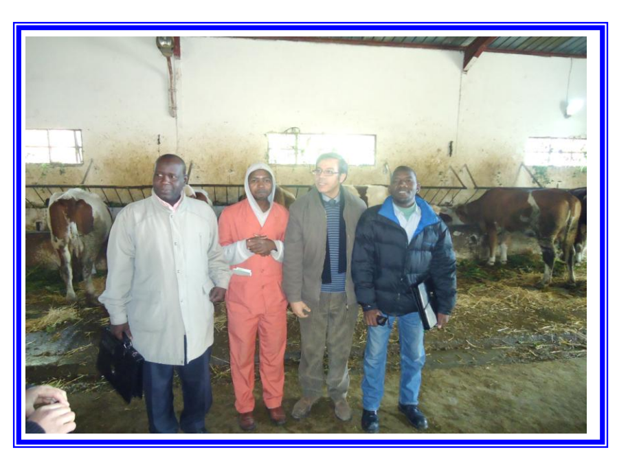
Training Program in Artificial Insemination for Cows, in the Algerian Ministry of Agriculture and Rural Development

- "Artificial Insemination for Cows", in the Algerian Ministry of Agriculture and Rural Development, Algeria, for 17 trainees from: Senegal, Burkina Faso, Cameroun, Mali, Democratic Congo, Mauritania and Niger, from 18/6 to 1/7/2011.